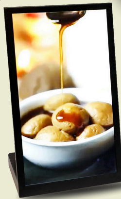
Table -Top Signage