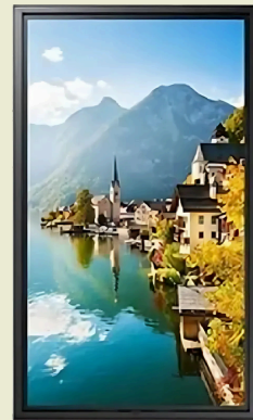
Wall Mount Signage